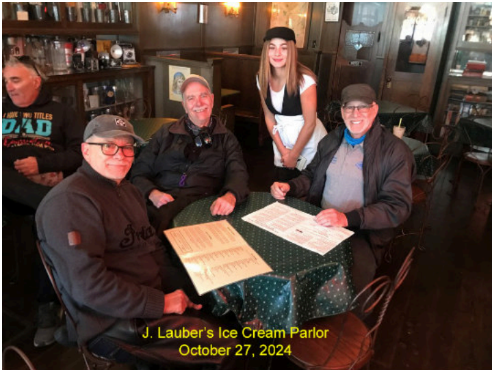
J. Lauber's Ice Cream Parlor October 27, 2024