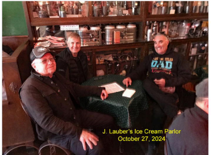
J. Lauber's Ice Cream Parlor October 27, 2024