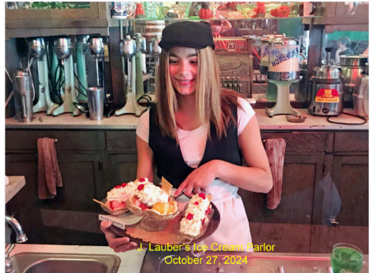
J. Lauber's Ice Cream Parlor October 27, 2024