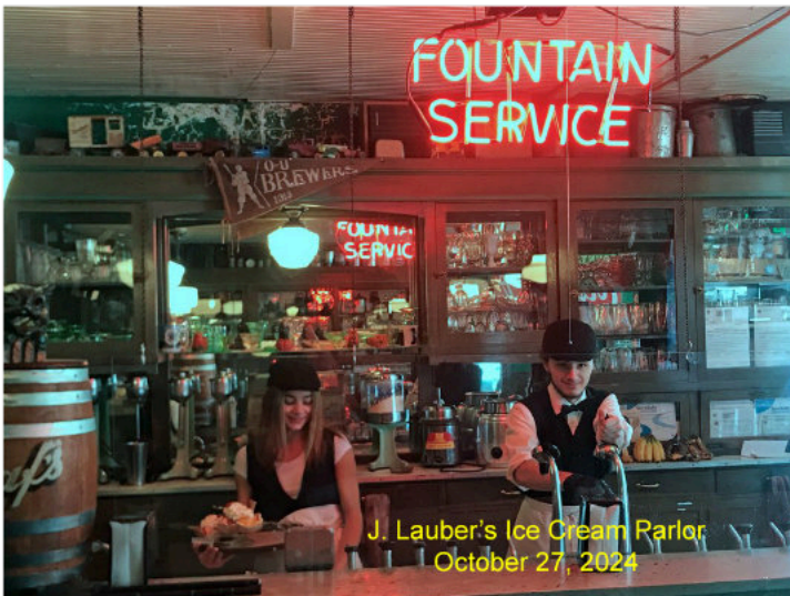
J. Lauber's Ice Cream Parlor October 27, 2024